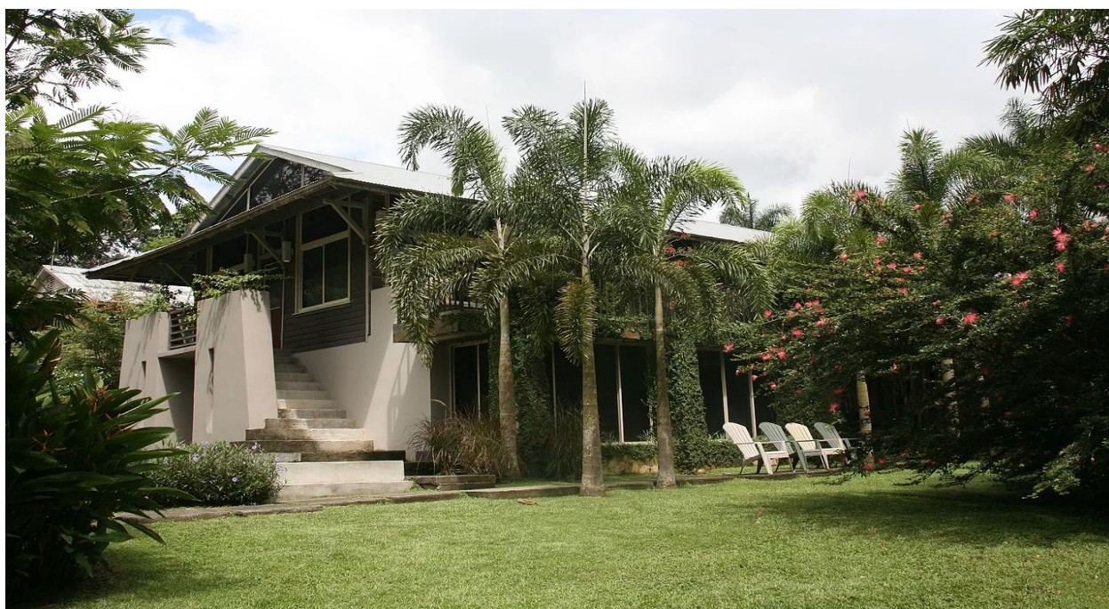
Casa Paraiso Missions Base - Paraiso Ancon